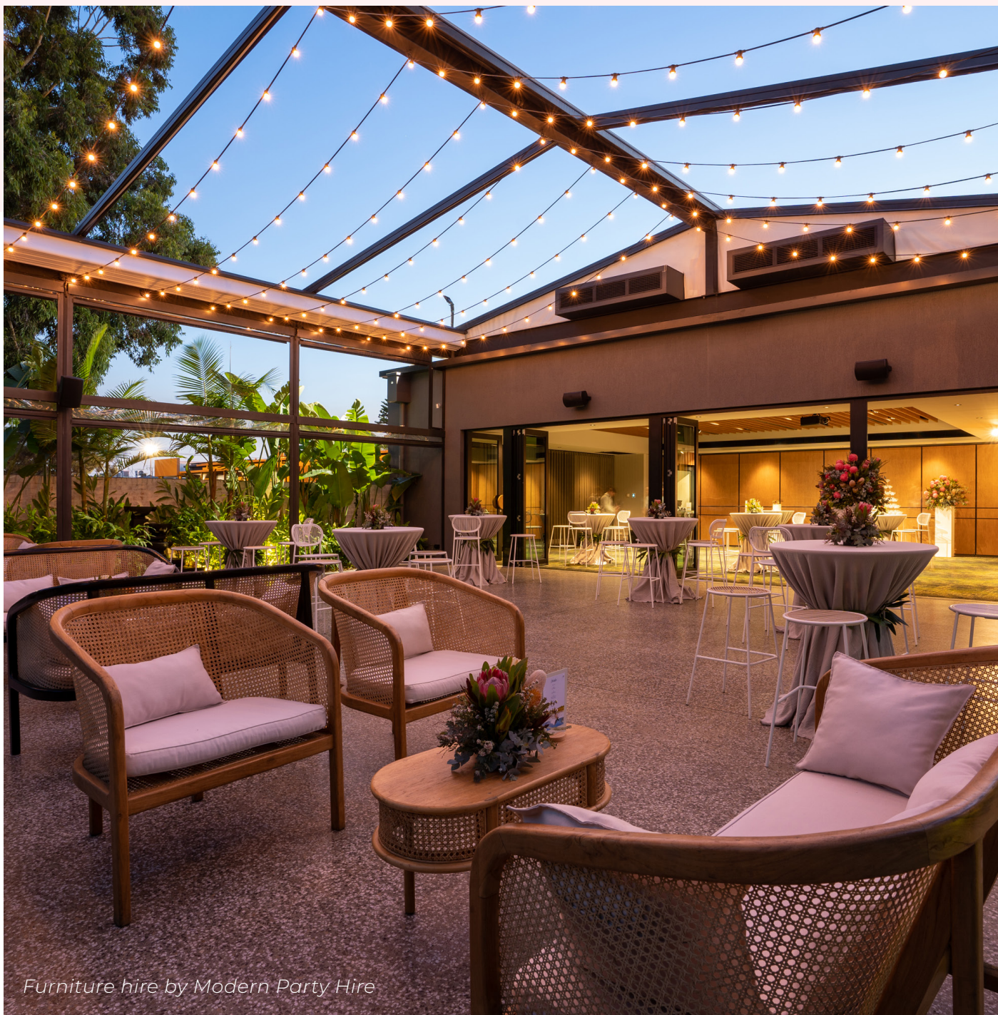
Furniture hire by Modern Party Hire